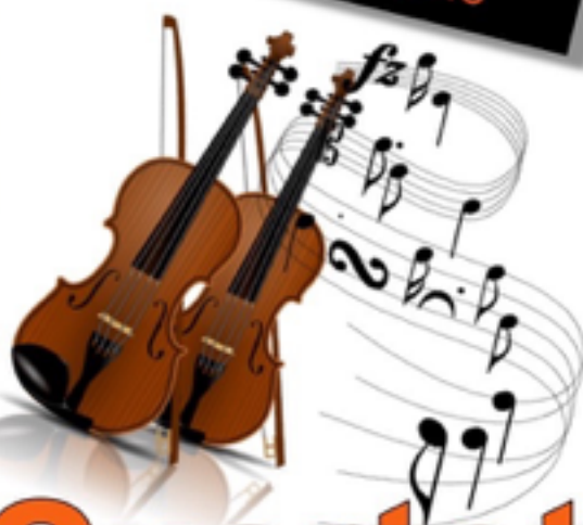
Fig Tree Quartet

an elegant night of classical and pop classic music