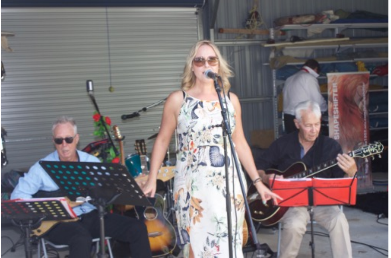
Nuages (above) and Mama Juju and The Jam Tarts (below)