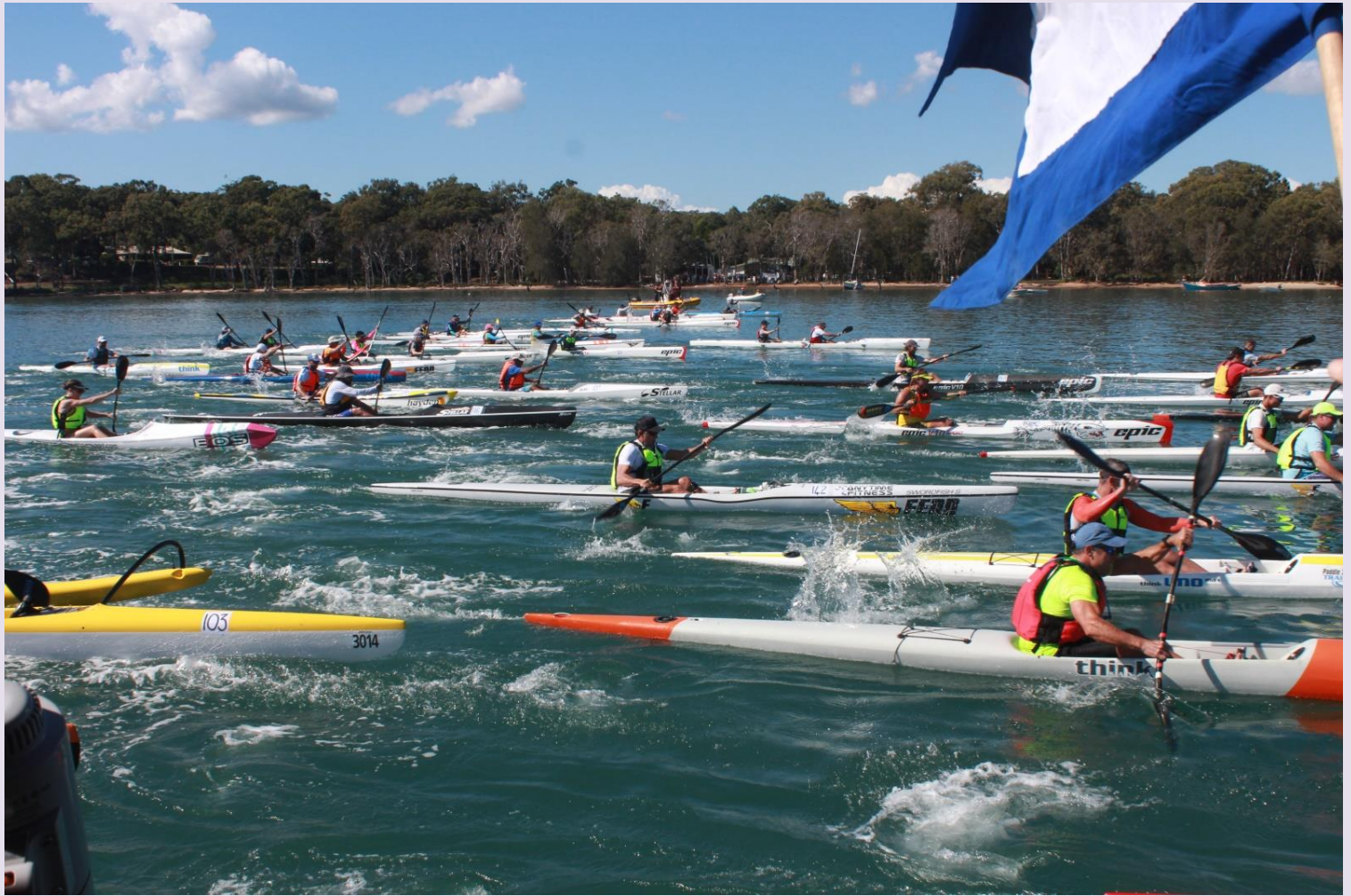
The start of the 2018 Macleay Classic