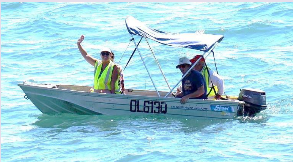
Volunteers contributed to the safety and success of the event